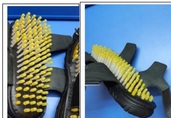
Figure 3 & 4: Reflexo-stump foot wear.

acts as a pressure spot for the target areas in the foot, A protective cap is fixed over the stumps to prevent damaging of the foot. Additionally it is recommended to wear a thin nylon socks before wearing the reflexo stump footwear.