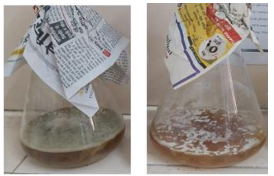
Figure 1: Colony morphology of Isolate ANF4.

During the study, endophytic fungus was isolated in the form of pure culture through leaves, and bark tissues of Terminalia arjuna . Based on the morphological observation, the colony characteristics of isolate ANF4 was isolated on malt extract agar (MEA) and maintained as pure cultures. They colony and microscopic morphology of the isolate was observed for the identification purpose. The colony morphology observation of the AF4 isolate in the flask culture showed similarity with Neurospora species. Filamentous hyphae were observed with axons woven into a closed mycelium.