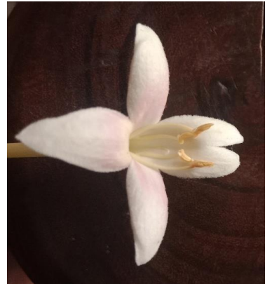
Fig. Anther & Flower