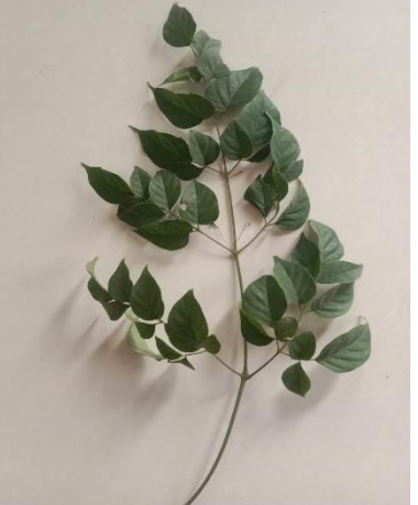
Fig. Leaf .