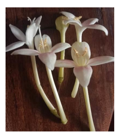
Fig. Flower Bunch.