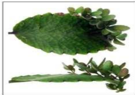
Figure 2: Bryophyllum pinnatum leaf reproduction.