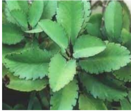
Figure 1: Bryophyllum pinnatum leaves.