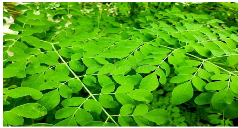
Fig. 3: Moringa oleifera leaves.