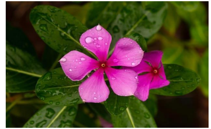
Fig. 4: Catharanthus roseus.