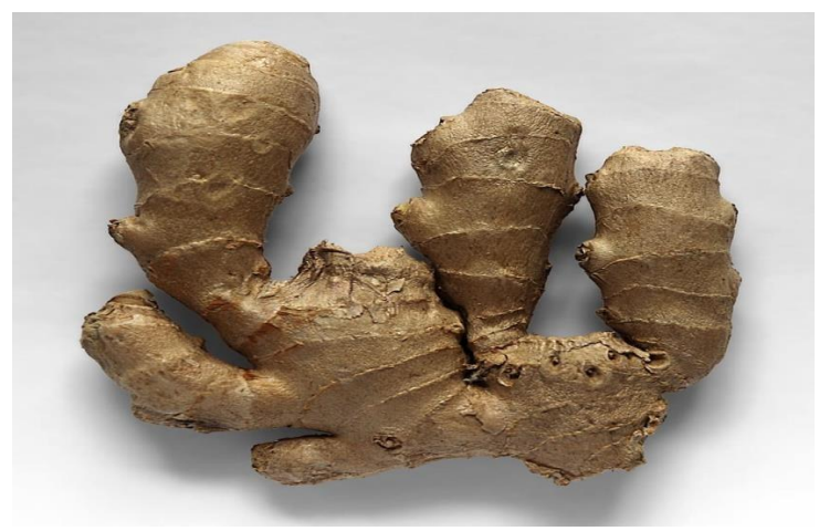
Fig. 5: Zingiber officinale roscoe.