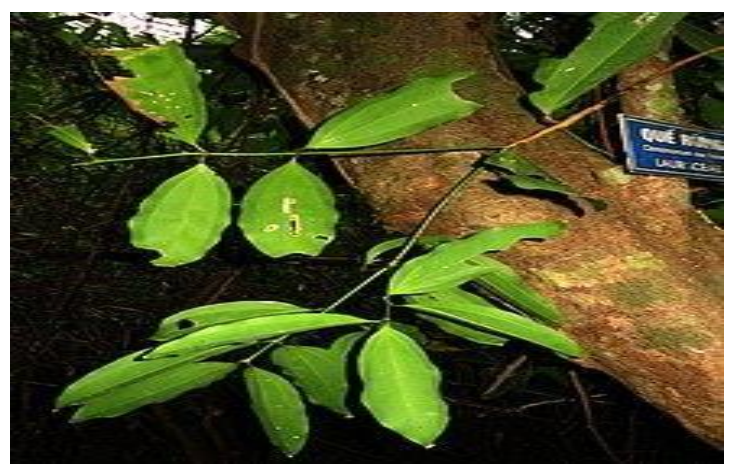
Fig. 2: Cinnamomum Iners.

Every type of cinnamon encompasses the compound cinnamaldehyde, constituting approximately 65 to 80% of the natural essential oil. Cinnamon is employed for addressing issues such as digestive atony, dyspepsia, gas, nausea, intestinal colic, and sluggish digestion.<sup>[20]</sup>