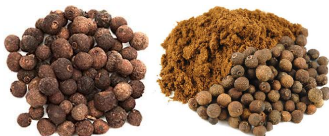
Figure-3: Kababchini as allspice berry.

Its active elements are methyl eugenol and caryophyllene, resin, tannin, sugar, quercetin, glycosides, and sesquiterpenes; and it contains metabolites of homovanillic and homomandelic acids, malic and gallic acids, lignin, and bonastre. Another active constituent is the phenol eugenol, which is used by dentists as an antiseptic and a local anesthetic for teeth. Eugenol is a phenylpropanoid that gives allspice its characteristic pleasant, sweet aroma. Pimenta dioica is used as a traditional herbal remedy for treating flatulence and indigestion because its volatile oils contain eugenol, a weak antimicrobial agent. It suppresses the activity of prostaglandins in human colonic tissue and stimulates some digestive enzymes, including trypsin, an enzyme important for the digestion of protein. Recent studies show that allspice oil combined with extractions from garlic and oregano can work against E. coli , Salmonella , and L. monocytogenes infections. It's used traditionally as a natural remedy for stomach-ache, vomiting, diarrhea, fever, flu, colds, fatigue, diabetes, menstrual cramps, heavy menstrual bleeding and hysterical paroxysms. One of its active constituents, eugenol, is used for its local anesthetic and antiseptic properties and is included in many dental products. Dentists use eugenol as a local anesthetic and antiseptic for teeth and gums. [2]