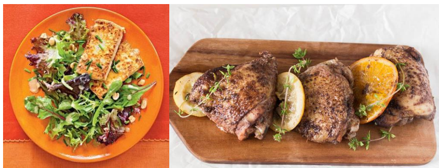
Figure-6: Tasty recipe becomes much yummy to get ready for tummy.

The IC 50 (DPPH), FRAP and TEAC, NO scavenging and ORAC activity were higher in methanol extracts compared to water extracts of allspice. Total flavonoid content, FRAP and TEAC, NO scavenging and ORAC were significantly higher ( p \leq 0.5 ) in methanol extracts compared to water extracts of allspice. This shows that allspice has antioxidant potential and that the method of extraction can play a crucial role on the number of phytochemicals extracted from the plant. Utilization of allspice in food products may provide additional functional properties. [5]