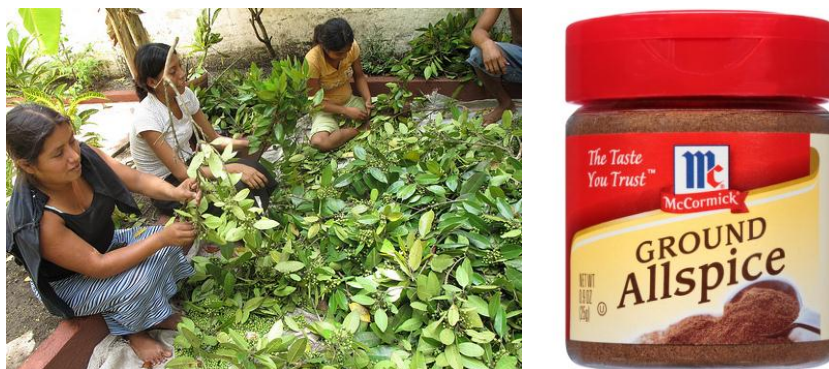
Figure-5: Allspice harvesting and packaging.

ash values like total ash value, acid insoluble ash value and water soluble ash values also found out. Alcohol soluble extractive value and water soluble extractive values were 19.2 % and 3.6 % respectively. The presence of alkaloids, saponins, tannins, flavanoids, proteins and triterpenoids are indicated by phytochemical screening of aqueous alcoholic extract of Pimento leaves. These results will help the fellow scientists and others who will research in Pimenta dioica to identify the plant and species. [4]