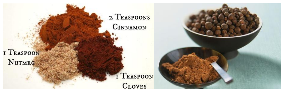
Figure-2: Allspice as a combo pack of all-spice.

The spice was imported to Europe soon after the discovery of the new world. There were several attempts made to transplant it to spice producing regions of the east, but these trees produced little fruit. Despite its rich fragrance and a strong flavour resembling other more coveted spices, allspice never had the same caché in Europe as cinnamon or pepper. The English started making regular shipments to England in 1737, but by that time the lust for spices been eclipsed by other New-World products like sugar and coffee. It was quite popular in England though, where it came to be known as 'English Spice'. In the Napoleonic war of 1812, Russian soldiers put allspice in their boots to keep their feet warm and the resultant improvement in odours is carried into today's cosmetic industries, where pimento oil is usually associated with men's toiletries (especially products with the word 'spice' on the label).