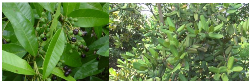
Figure-1: Pimenta dioica (Allspice plant).

French: Piment , Piment Jamaïque , Poivre aromatique , toute-epice , poivre de la Jamaïque , German: Piment Neugewurz , Allgewurz , Nelkenpeffer , Jamaicapfeffer , Englisches Gewurz , Hungarian: Jamaikai szegfubors , Szegfubors , Pimento , Amomummag , Icelandic: Allrahanda , Italian: Pimento , pepe di Giamaica , Norwegian: Allehande , Polish: Ziele angielskie , Portuguese: Pimenta da Jamaica , Russian: Yamaiskiy pjerets , Spanish: Pimienta de Jamaica , Pimienta gorda , Swedish: Kryddpeppar , Turkish: Yeni bahar .